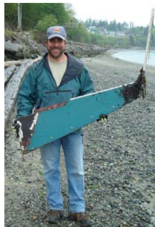
The fearless and admittedly quite daft neighbors of HSG did indeed duck downpours on Earth Day weekend to rid our beach of all manner of trash, including the prize haul of the rudder seen at left